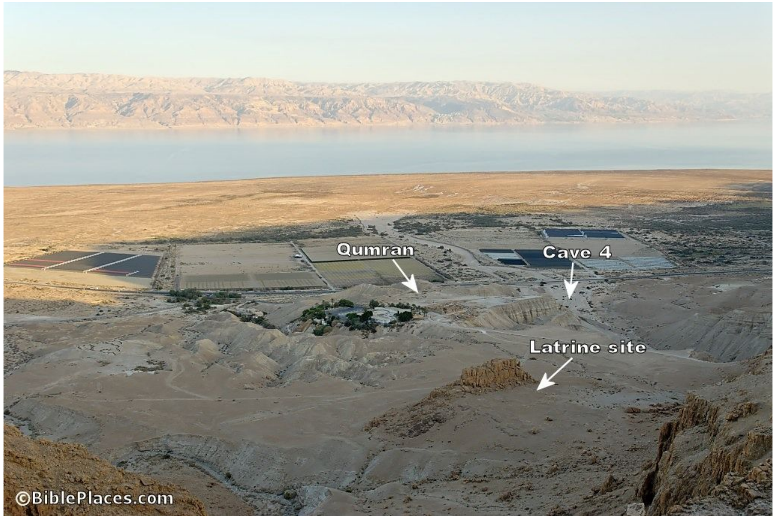
Qumran settlement , viewed from the West, showing latrine area.

Le Nouvel Observateur echoed the Revue de Qumran (winter 2006) in announcing the discovery of latrines at the site of Qumrân , latrines which lent credence to the Essene thesis. Supposedly, the sect of the Essenes had fixed rigorous rules concerning the places of toilet, with the recommended burial of excrement with a shovel, and that only to the northwest of the dwellings, about five hundred meters away. As discoverer Joe Zias explained, “the Bedouin of the desert have no such custom. So, we finally have proof of the Essene occupation of the site.”