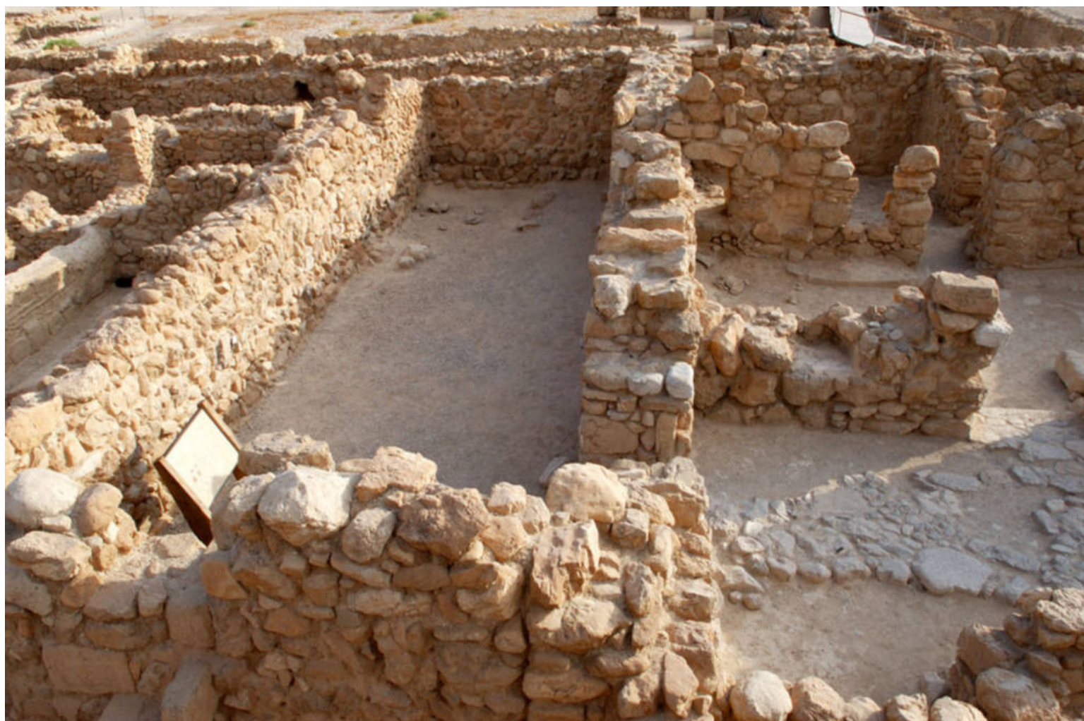
Qumran: supposed "scriptorium."

Enough. Time to put an end to this fantasy. "Essene monks" are the fabrication of hypotheses that are groundless (and often improbable). They are a construction which, alas, became the tree that hid the forest for too long, the forest of a vast Messianist current that existed and did not disappear in the year 68 AD. Quite the contrary. A question arises here: why such relentlessness in trying to demonstrate the idea of "Essene monks?"