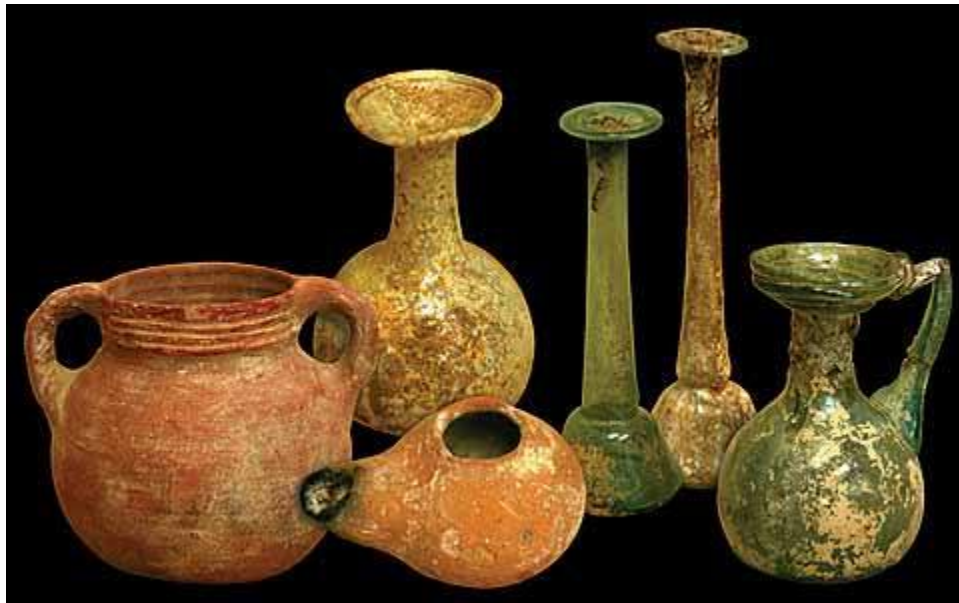
Glass vials and jar; ceramic lamp and jug.

Among the archaeological materials found on the site of Qumrân are also pottery and glass. Remnants of production from both indicate on-site manufacturing, particularly costly glass, even though this manufacturing was not year-round but only during the stay of specialized, itinerant craftsmen. Such a cost was justified given the production of vials intended to contain the various perfumes – which were used less for cosmetics than for worship and burials.