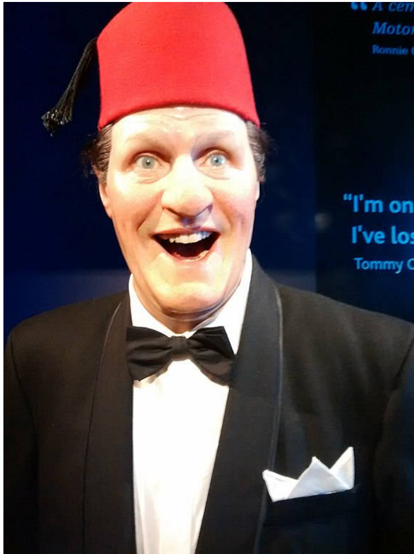
Tommy Cooper at Madame Tussauds.