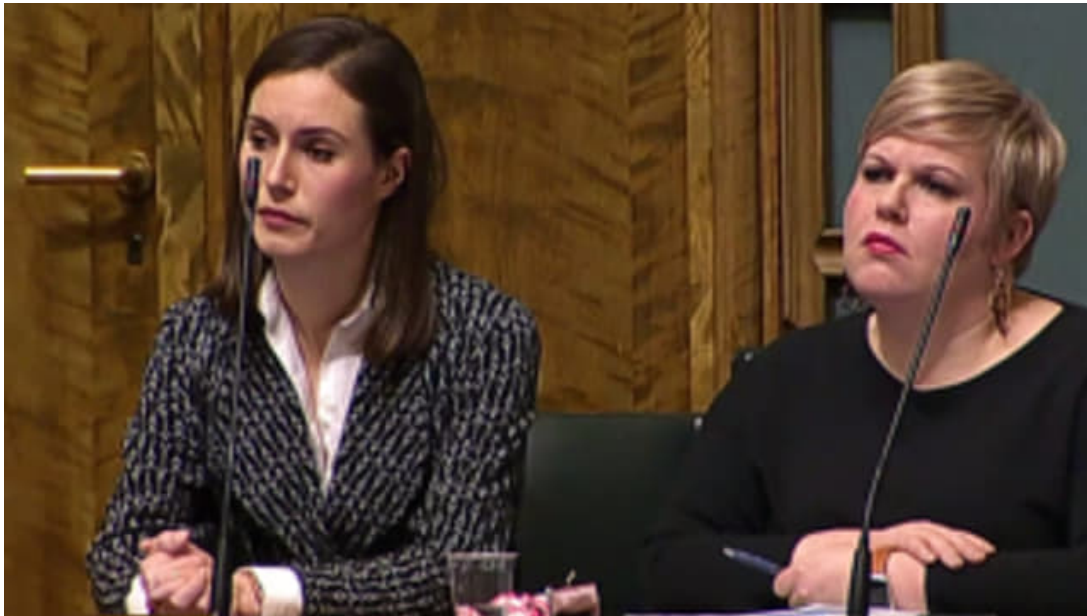
Figure 6. The Prime Minister of Finland (left) and the Minister of Finance (right) of Finland as student at Klaus Schwab's Young Leaders program.

Through Klaus Schwab's Young Leaders program, the WEF has infiltrated Finland's cabinet, as the current Prime Minister and Finance Minister are now students in the program (Figure 6).