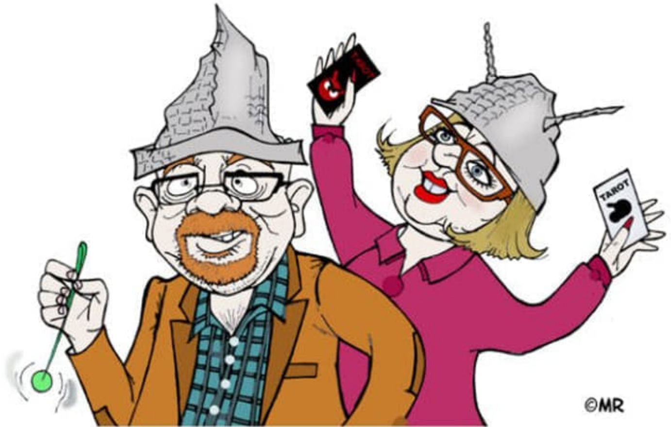
Figure 2. The UN and Finland's future research is a sandbox for occult mystics. (Figure is from Paunio's newest book, Hourulan väen ilmastovallankumous , 2019). Cartoon Credit: Mika Rantanen.

Wildman created four new machine-human categories for transhumanists which, according to Wildman, they come from outer space: 1) Etorgs, 2) Macrorgs, 3) MVorgs and 4) Psyorgs. Etorgs are lizard-like human-hostile extraterrestrial organisms known from Hollywood films, i.e., classic UFOs, Macrorgs are perhaps even galactic life entities according to the Gaia theory, which classifies the Earth as a living organism. MVorgs are apparently micro-life forms, born from bits of consciousness, and finally Psyorgs are angels, draculas and the like, born from the existence of non-material consciousness. Let us remember that Rudolf Steiner presented the true spiritual order of the world, which included angels, seraphim, cherubim, luciferic spirits, astral storms and etheric bodies.