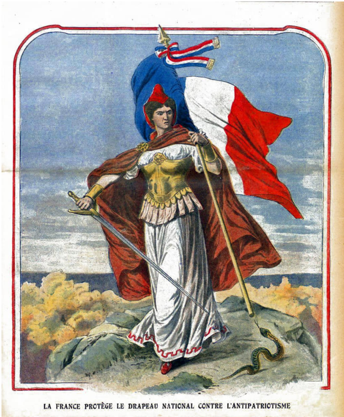
LA FRANCE PROTÈGE LE DRAPEAU NATIONAL CONTRE L'ANTIPATRIOTISME